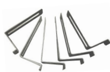
Z-shaped Iron Piece x6