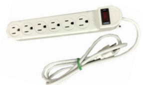
6-outlet Power Strip (option)